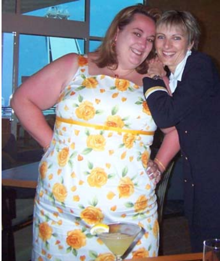
Before Pregnancy – Sept 6, 07